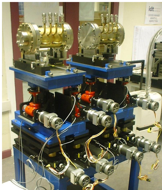
Above: Dual beam splitter masks with motorised platform for pitch, yaw, height & traverse.

Since, for many beamlines, only a very small fraction of the central cone of the undulator beam is ever utilised, the outer 'cone' may be safely absorbed without altering the essential characteristics of the line. Up to 95%+ of the heatload can be safely removed in this way so that a typical 4kW beam is reduced to <100W, ensuring heatloads are minimised onto sensitive optical components further downstream and reducing overall costs of applied cooling throughout the line.