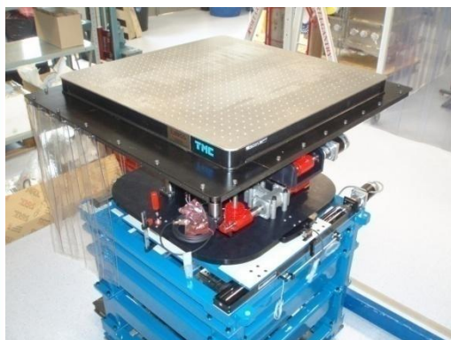
Above: Sample table used on I22 NCD end station @ DLS

Fully motorised with pitch, roll, yaw and up to 2 translational degrees of freedom.